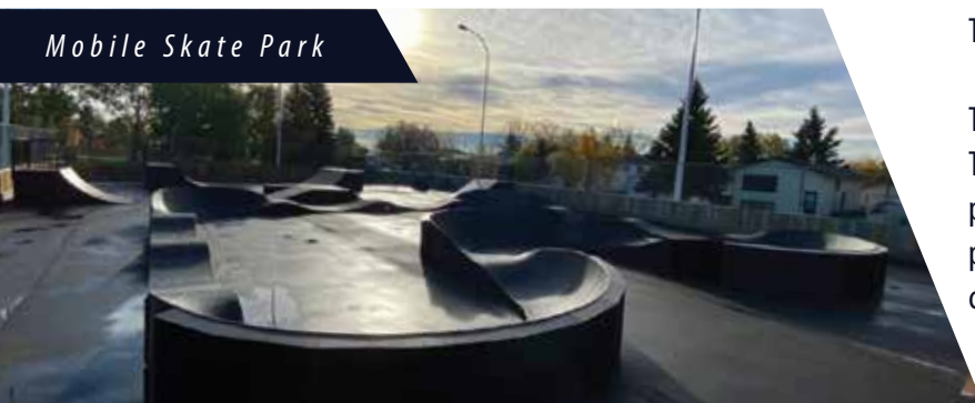
Mobile Skate Park

The Board includes 11 Public Members appointed by Council. They advise the City on significant recreation and cultural projects, ongoing engagement activities, review and provide feedback on recommendations for community grant funding.